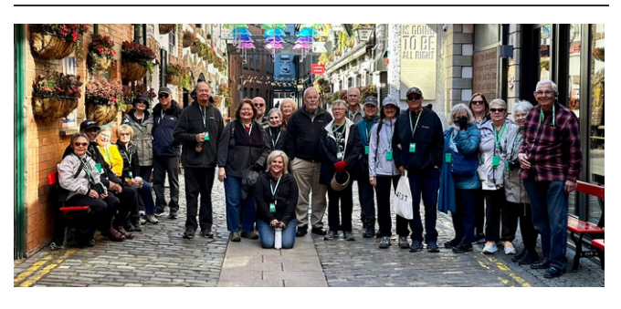
OLLI Trip: Ireland: The Wild Atlantic Way & Dublin April 18- May 1, 2023

No Registration needed for this presentation.